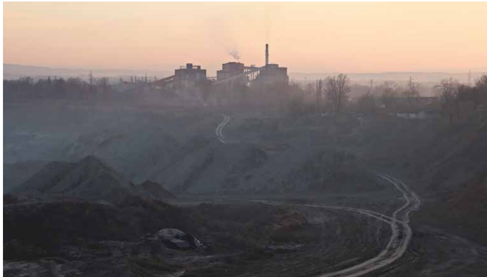
Thermal power plant in Veliki Crljeni, Lazarevac