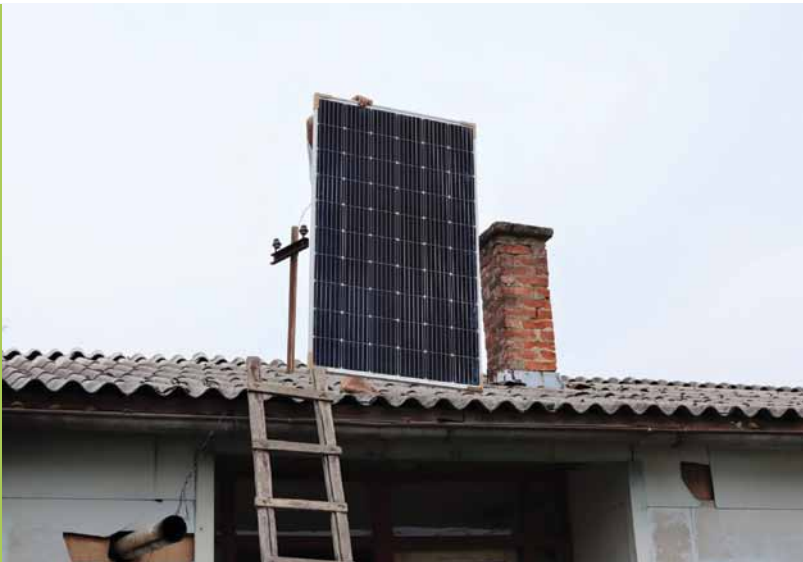
Humanitarian campaign "Ray of sunlight – light of hope"

governments and local authorities offering clear financial incentives and a favourable permitting framework, they will most likely remain a small number of demonstration projects rather than making up a serious component of the region's just green transition.