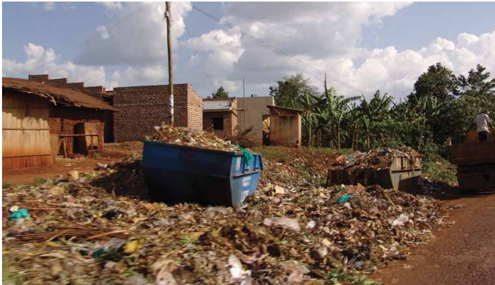
Waste management

labelled PM2.5 and PM10 [Particulate Matter], which is exactly the kind of pollution that gave rise to the protests.