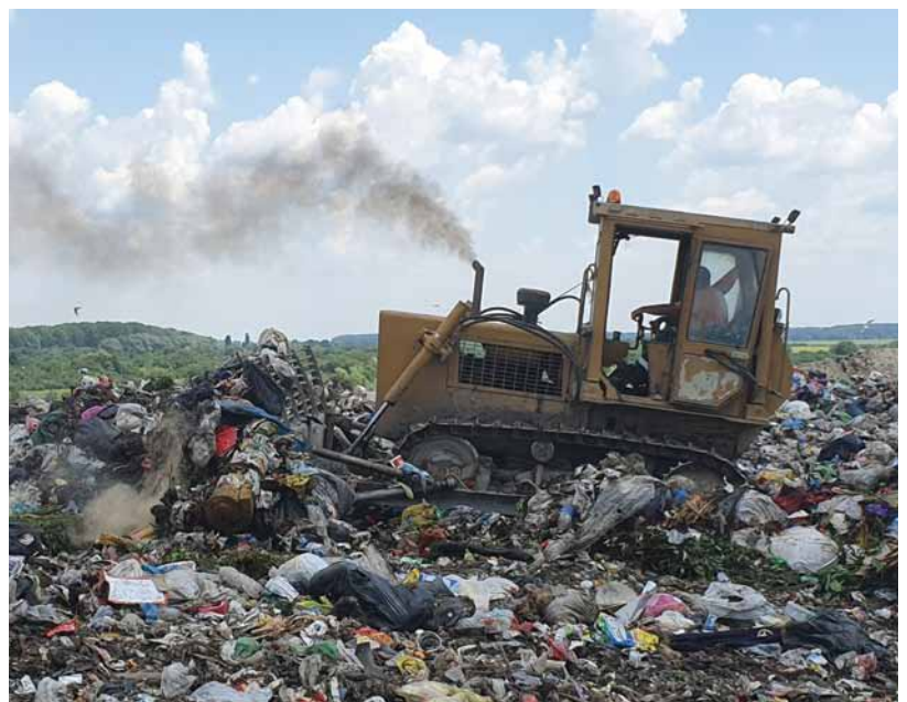
Waste dump

We have also been unable to measure how environmentally and socially conscious the inhabitants of Europe truly are, as even without their help, China has banned the import of waste, deciding that it will no longer be the Western world's waste dump