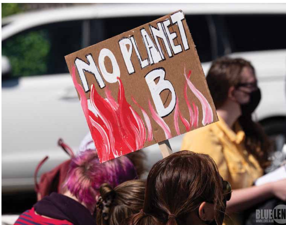
Climate strike