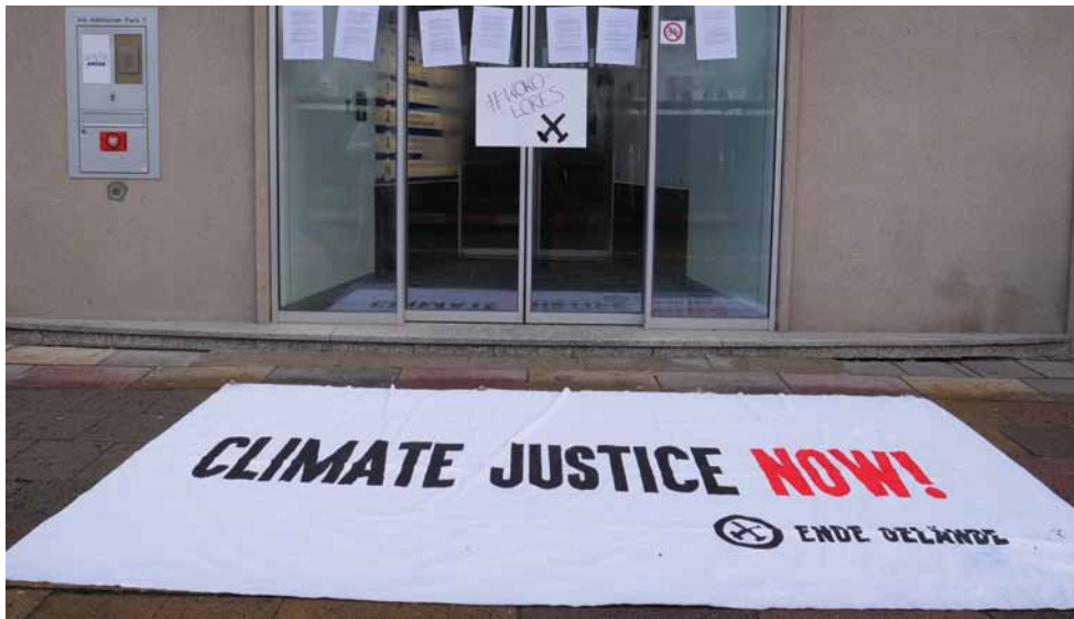
Ende Gelände Berlin visits BUND headquarters to remind people of the Paris Climate Agreement. The results of the coal commission are not compatible with the 1.5°C target.

these cases, public resources are heavily abused or misused to serve other interests, and therefore there is no real political power behind advocacy for change.