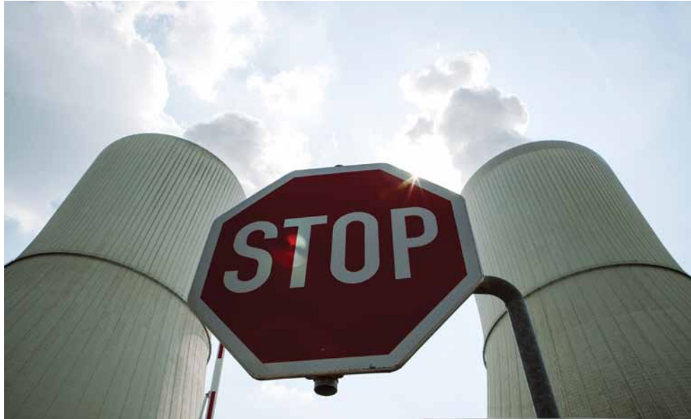
Kohle stoppen! Photo by Pay Numrich / Kohle erSetzen! (CC-BY-NC 4.0)