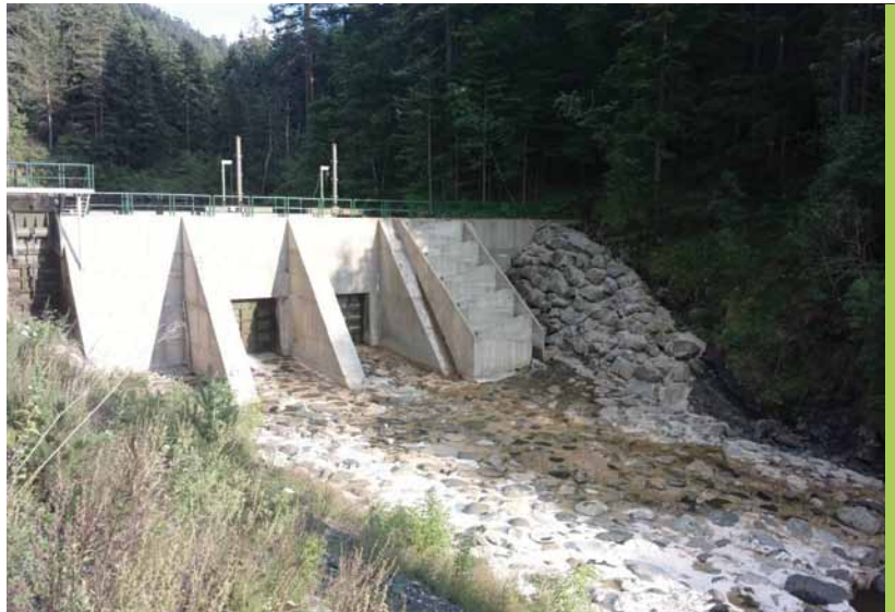
Mini-hydropower plant destroyed the Gostović river near Zavidovići

Several civil society campaigns have been initiated recently against the micro-hydropower plants. The governments issued hundreds of concessions and licences to build such facilities as a form of green energy, subsidised with public funds, with symbolic concession fees. Their permits prescribed so-called "minimum environmentally acceptable flow", but no one ever checked whether these obligations were being