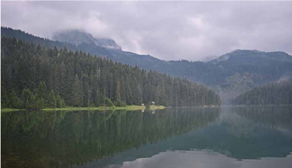
Montenegro - Durmitor National Park - Crno Jezero. The Durmitor is a massif located in northwestern Montenegro. It is part of the Dinaric Alps. Its highest peak, Bobotov Kuk, reaches a height of 2,523 meters.

If one in five households in Montenegro were to install a 20 m 2 solar (roof) panel, they would produce as much electricity as the Komarnica hydropower plant is expected to produce. Besides being cheaper, such investments have an incomparably smaller environmental impact. This clearly indicates that Montenegro should rely on several sources (types) of energy production.