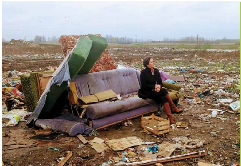
Woman at the waste dump

For these reasons, the issue of monitoring and control of the polluters, and the establishment of an efficient system of