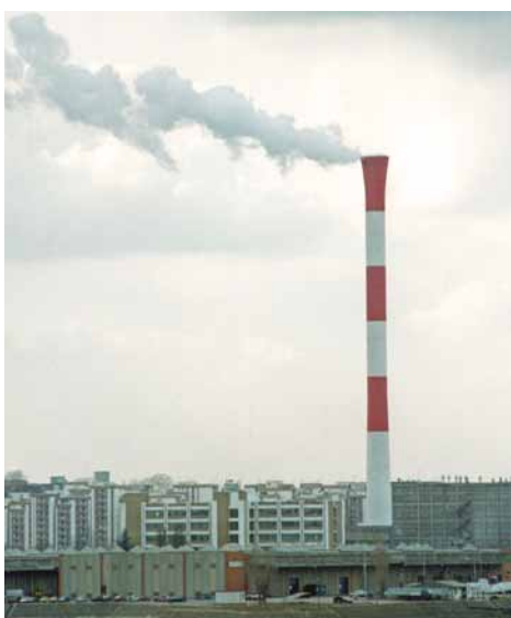
Serbia: Dorcol Belgrade

The Green Agenda is widely supported by the Economic and Investment Plan for the Western Balkans, adopted by the European Commission earlier in 2020, which envisages 9 billion EUR for projects focused on decarbonisation, the renewable energy sector and building renovation.