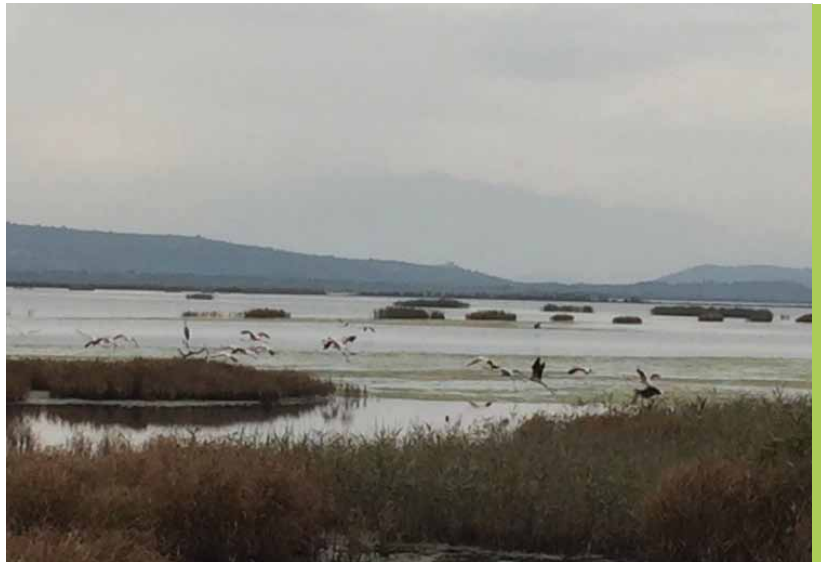
Bird sanctuary Solana Ulcinj

In the referendum held on May 21, 2006, Montenegro became an independent state. 55.54% voted to secede from the state union with Serbia, while 44.46% voted to remain. This was also a kind of rarity because the majority required for the decision to secede