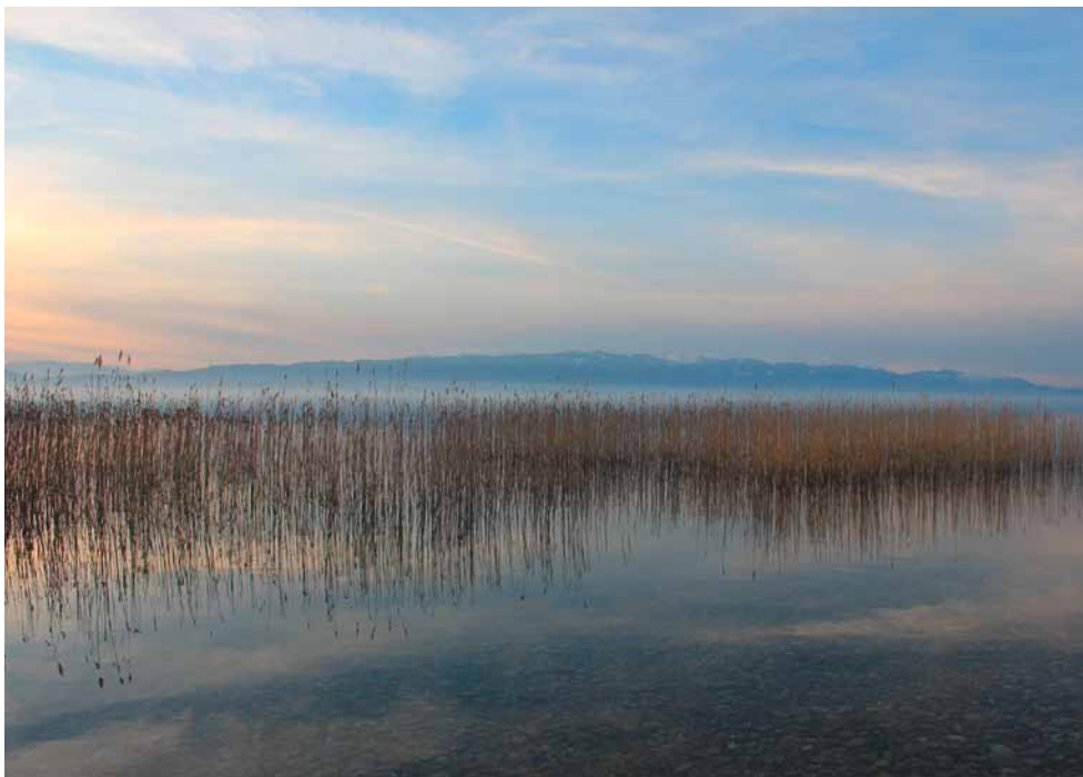
Lake Ohrid, Macedonia

Thus, populism and its initiatives are a resistant social phenomenon aimed at suppressing the dense composition of the ruling elements. At the same time, they