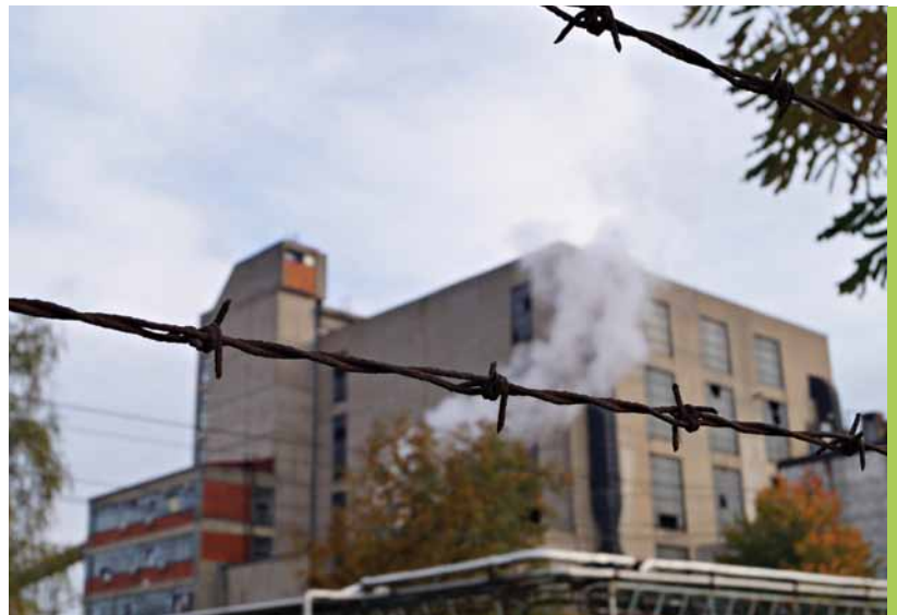
Thermal power plant in Veliki Crljeni, Lazarevac

The first step towards regaining trust is providing the citizens of Lazarevac with accurate and timely information about the just transition process. Furthermore,