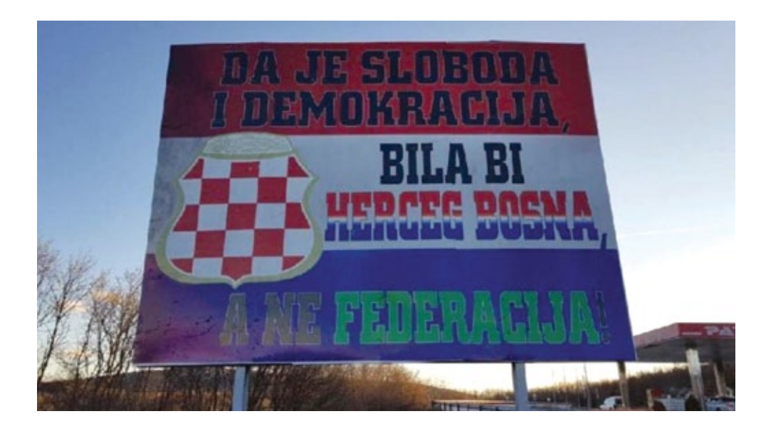
"If there were freedom and democracy, there would be Herzeg-Bosnia instead of the Federation", location unknown

In respect to the Hungarian-Croatian relations during the Habsburg era, the Croatian national identity-building canon portrays Hungarian politics exclusively as those of trying to subjugate Croatia under its own rule. Again, it is the truth, however, the more comprehensive picture of the Hungarian-Croatian relations that is missing. What is missing, or is not sufficiently underlined, is that Croatian politics from the late 18th century onwards regularly opted for alliances with Hungary out of fear of Habsburg absolutism. In that respect, the 1868 Croatian-Hungarian Settlement subordinated Croatia to Hungary not only due to Hungarian political pressure, but also due to the contemporaneous Croatia's institutional incapacity to fully exercise financial, infrastructural and economic policies, as Josip Horvat nicely shows in his books. Moreover, the Hungarian 1848 national leader Lajos Kossuth has been portrayed as the most extreme Hungarian nationalist and thus