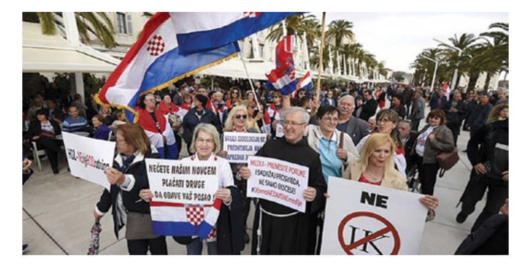
thousands of people at a protest march in Split by citizen's initiative 'Croatia against Istanbul Convention'

All of this lasted until the structure of the state was consolidated. This form of activities was then no longer needed for the development of a national project; the public/political work of the groups which carried it out was either terminated, or their activism took on a different form. Their status was put in hibernation so that they could