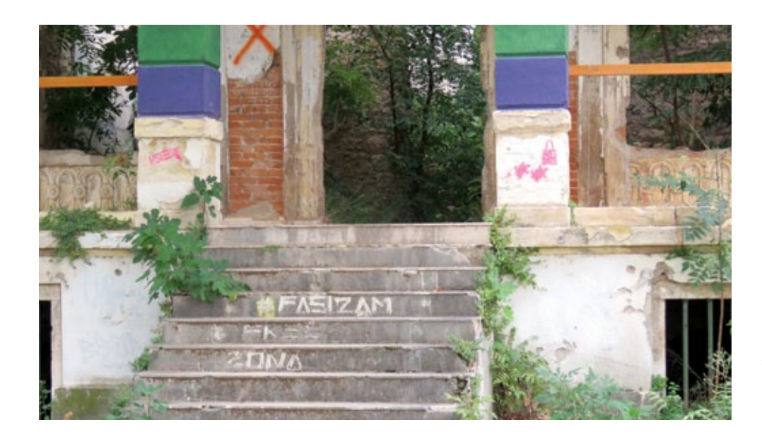
In the vicinity of the Partisan Cemetery, Mostar

systematically displaced, raped, killed. In Srebrenica alone, more than 8000 boys and men were killed. Dodik is denying the genocide to this day.