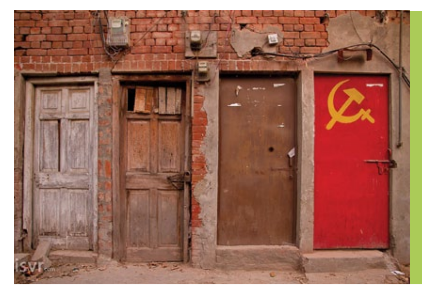
"Communism got colours"

Stressing the significance of Antifascism, which in the post-Yugoslavian phase first intensified in Croatia, especially disturbed the spirits in Serbia, where suddenly the Partisan liberation struggle became vital to identity: the Partisans were primarily Serbs, while others only took a marginal part in the struggle. Serb PLM members were acknowledged to an extent, but Tito remained completely obscured by intentional, and therefore mendacious forgetfulness. Under the influence of the monopolising of Antifascism within the European framework that was increasingly spreading from the Kremlin, Serbian nationalists wholly appropriated the Yugo-