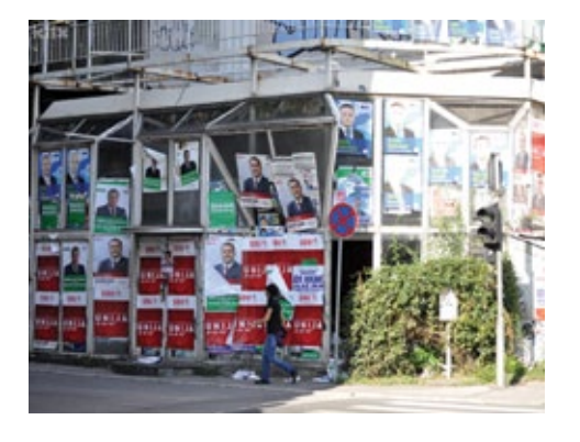
Sarajevo city center plastered with 2016 election campaign posters, klix.ba, Photo by Nedim Grabovica

support for parties from one election to the next.<sup>5</sup> General volatility for the BiH Parliament elections is very high, tentatively suggesting an extremely unstable party system. There is also significant change over time where voter support shifted by 30% to 74% between two elections. Even if we take into account changing pre-electoral coalitions, the values still range between 18% and 29%. This, however, does not mean that voters in BIH are willing to support any political alternative.